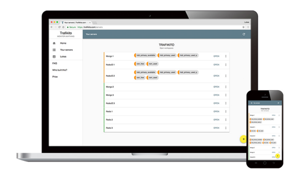
Figure 2: Trafikito, an app that uses Material-UI to support for mobile and desktop clients.

A full discussion of the pros and cons of ClojureScript is beyond the scope of this paper, but it might suffice to say that ClojureScript offers very low maintenance costs and powerful language features at the cost of a strenuous learning process. Unlike Python, Java, or JavaScript, ClojureScript is not object-oriented and does not have ALGOLstyle syntax, making it syntactically and semantically unfamiliar. This is a serious penalty, as it may reduce the number of number of people who could contribute to the app's development. However, this may turn out to be a price worth paying, and as we will see in section 2.3.2, this disadvantage can be mitigated somewhat by allowing users and developers to extend the app using more familiar programming languages.