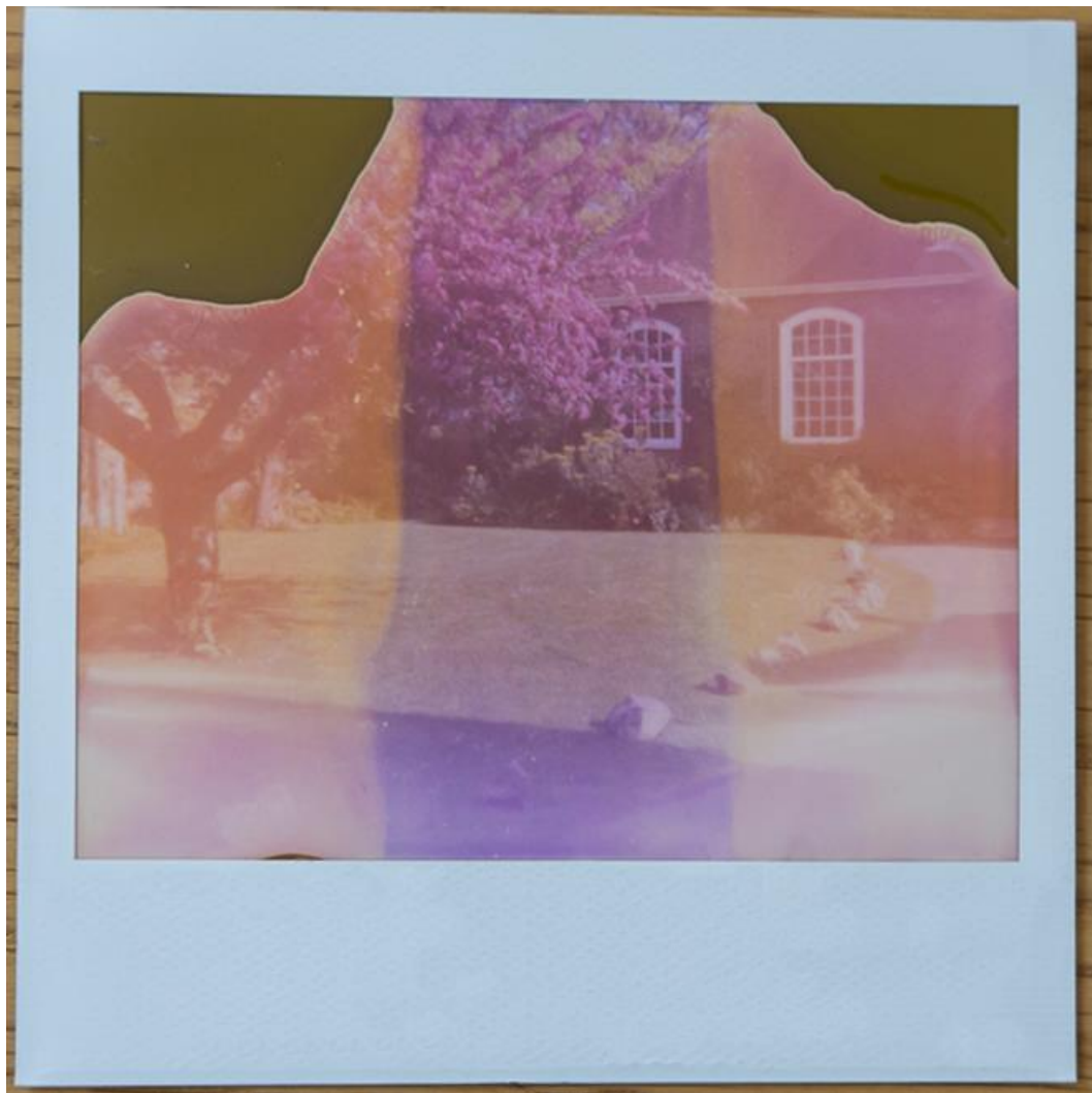
Polaroid 4: The Friends House.

I asked if he was responsible for the adjacent Friends House garden, commenting how gorgeous it was with immaculately trimmed trees and hedges. He started to walk away with the dead trimmer in hand, and without looking back, said, “well... it’s not just me.” He never did turn back, just kept walking away towards the garage on the far side of the Friends House. I felt a little rejected, convincing myself that maybe he had other things to do. I wonder what happened? Had I said something to offend him? Did he have somewhere to go? Did he not want to talk about “the others” who tended the garden, and if so, why not? Maybe he was deaf, and that once he had turned away, he couldn’t hear a thing. After all, it was he who had started the conversation in the first place, and then casually walked away. I never got to ask him about the best place to photograph the Cathedral.