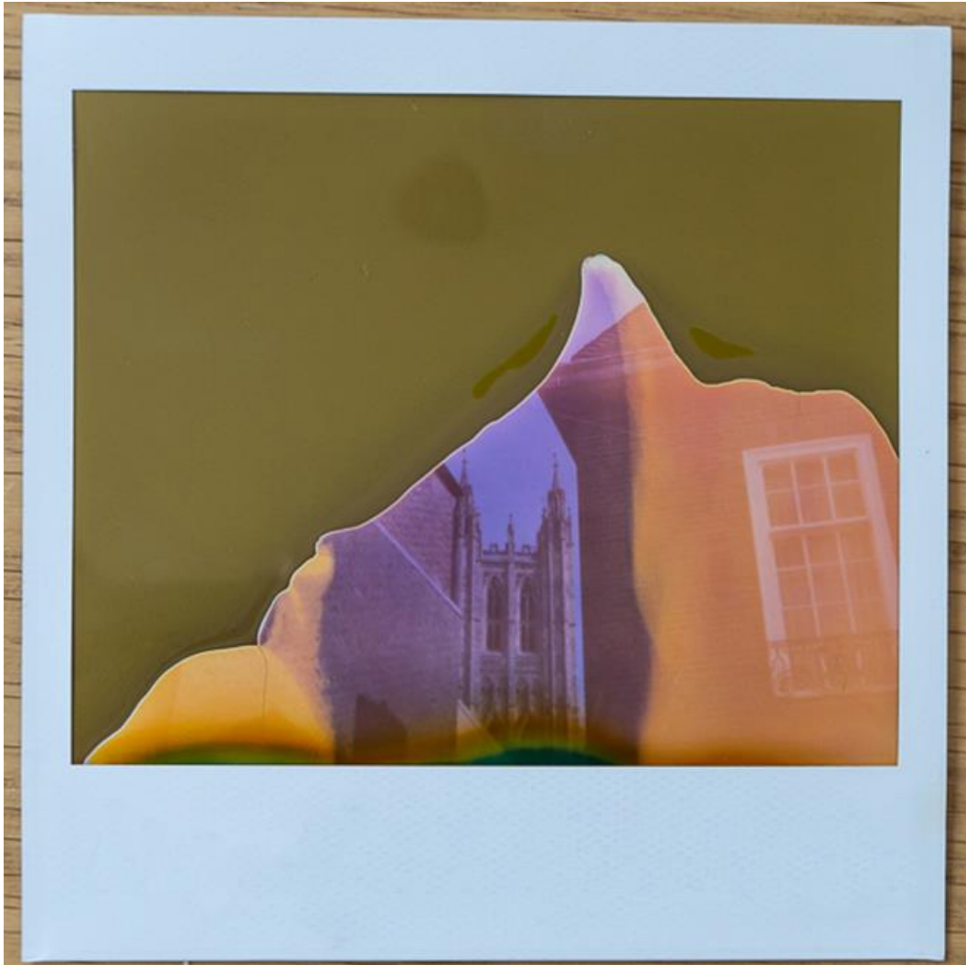
Polaroid 2: A glimpse of the Cathedral.

My chance to use this new opening line came and went before I could deploy it. I was enjoying a view of the river near The Friends House when a man who was trimming the grass on the riverbank emerged onto the bridge. He initiated a conversation about the battery life of his power trimmer.