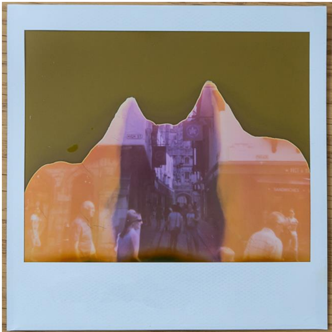
Polaroid 1: Busy street.

and after a couple of attempts to make conversation with tourists it became clear that we couldn't understand each other, and that we were all transitory in the space.