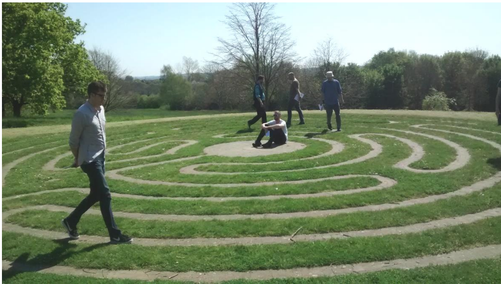
Photo 1: Participants begin gathering at the Kent labyrinth to perform the soundshot

At the agreed time participants gathered on the outdoor labyrinth to perform the soundshot, the chosen site serving as a stage for the creation of a site-specific sound collage.