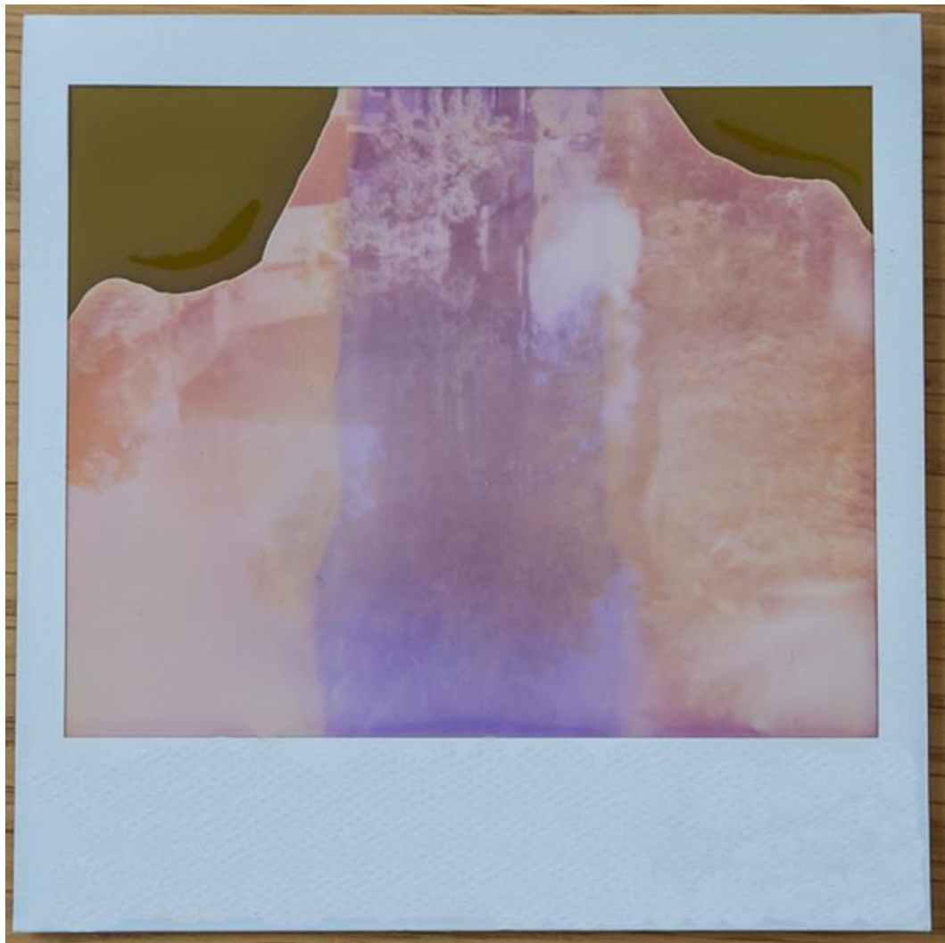
Polaroid 3: The riverbank.

He simply looked at me and said, “It’s gone again and doesn’t last very long at all, which is probably a good thing as there is a nest just there,” and he pointed to the spot where his trimmers had clearly not touched the long grass. When I asked whether it was bees or wasps in there, he explained, “ducks, with eggs inside.”