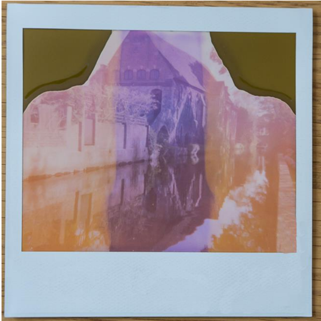
Polaroid 5: View from a bridge.

Just then, a middle-aged couple arrived to see what I was looking at. “What a wonderful view,” the lady smiled. “Yes, it’s lovely,” I replied. As she leant her elbows on the wall of the bridge, I shuffled along so she and her companion could see what I had been admiring: the reflection of an old building and a weeping willow tree, with sunbathers further up the distant banks of the river.